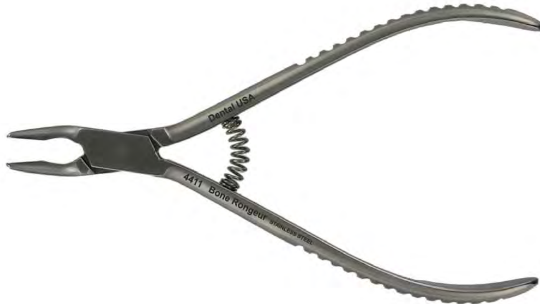
5. 4411 : BONE RONGEURS